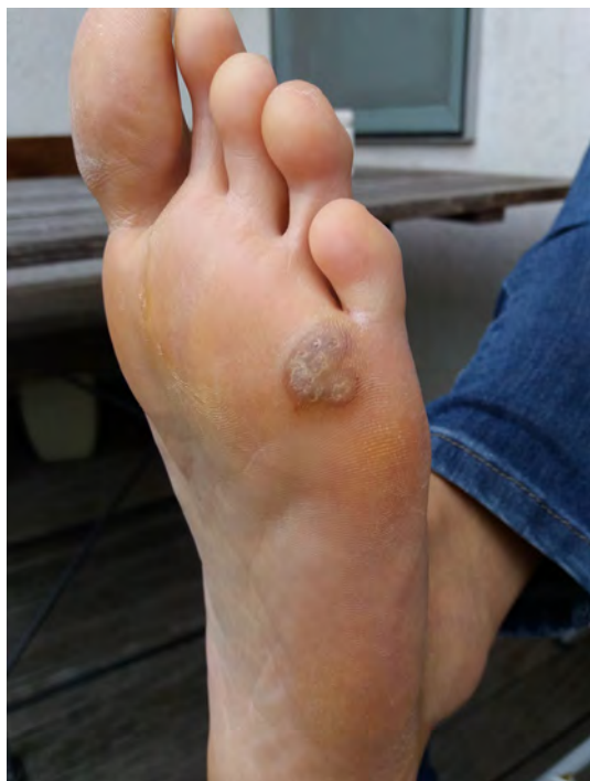
FIGURE 10 Patient 4—5 d after the treatment