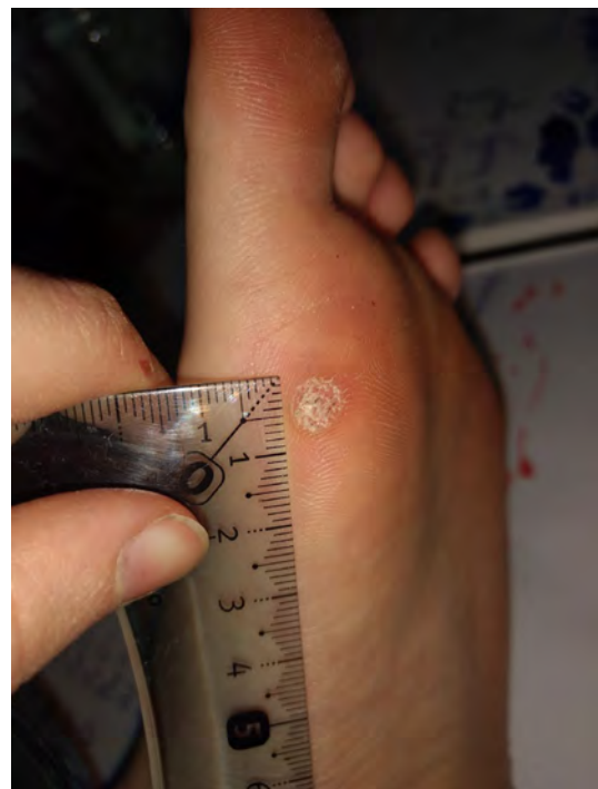
FIGURE 4 Patient 2—Before the treatment

The minimal follow-up period was 12 months for each patient, but in some patients, follow-ups were as long as 3 years (see Figures 2-7). Out of 85 patients included, a fifth of the patients ( n = 17 ) did not finish with the treatments; 3 patients were lost to follow-up, while