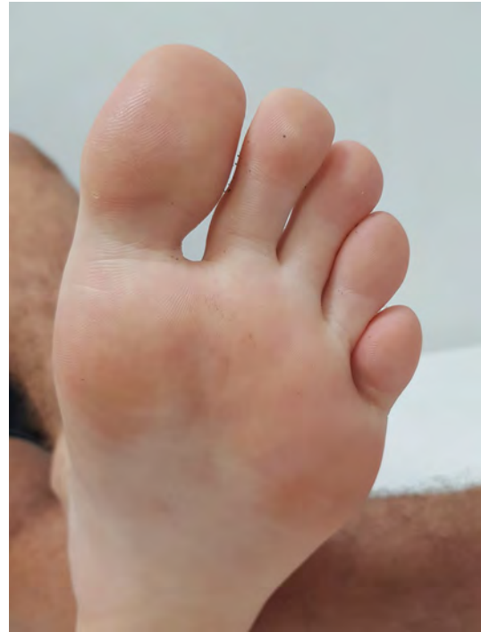
FIGURE 3 Patient 1—16 mo later (2 treatments)

85 patients, 45 women and 40 men, with a combined total of 174 warts were included. The mean patient age was 31 (range 7-69 years) (Table 1). More than half of the lesions were plantar warts ( n = 114 , 66%); there were 22 warts on toes, 26 on fingers, 9 on palms, and 3 on knees. One third of the patients ( n = 32 , 37%) was treatment naive; the others had cryotherapy, topical treatments (mostly