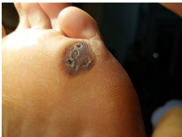
FIGURE 11 Patient 4—20 d after the treatment