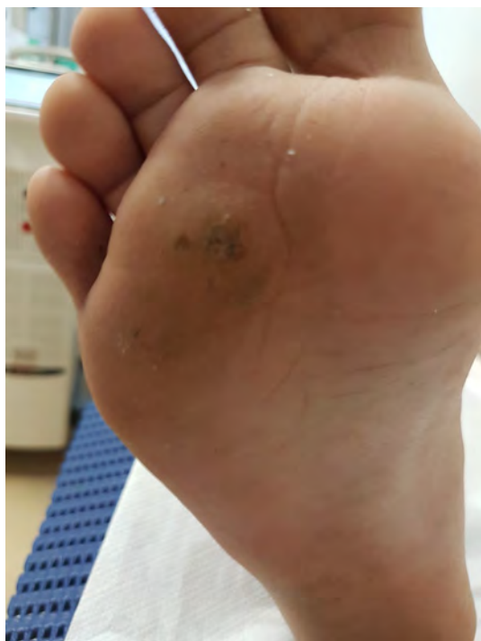
FIGURE 6 Patient 3—Before the treatment

14 continued with other methods (surgical excision, cryotherapy, or OTC topical treatment). Four of these patients listed pain as the main reason; one said he was bothered by the smell during the procedure, while others did not provide a special reason for discontinuation of the laser therapy.