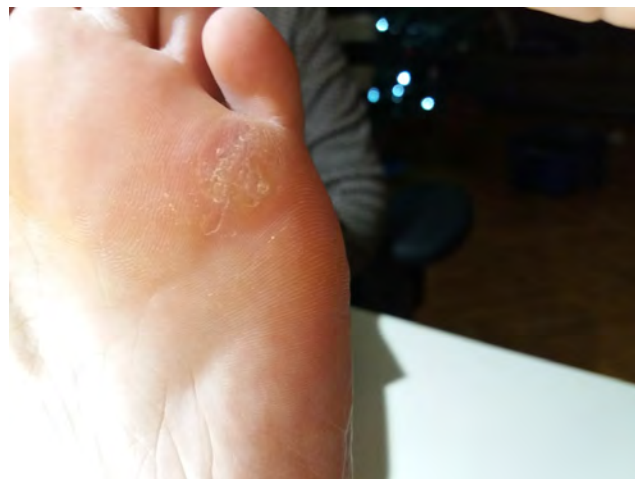
FIGURE 12 Patient 4—6 wk after the treatment