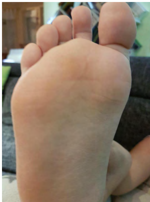
FIGURE 7 Patient 3—1 y after a single treatment