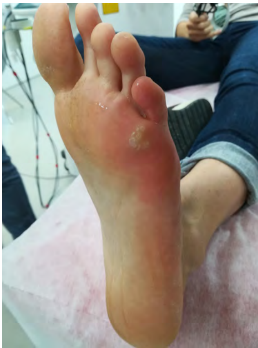
FIGURE 9 Patient 4—Before the treatment

pressure on the wart, for example, walking. No hypo/hyperpigmentation or scarring was reported by any of the patients.