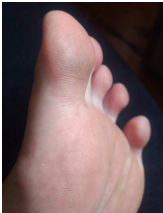
FIGURE 5 Patient 2—9 mo after a single treatment