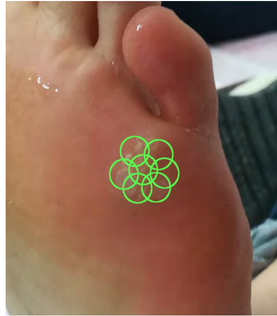
FIGURE 1 Pulse placement technique

This was a retrospective chart review study that was conducted at the Medilase Laser Center, Ljubljana, Slovenia. Ethics approval (No. 0120-448/2019/9) was obtained from the National Medical Ethics