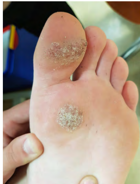
FIGURE 2 Patient 1—Before the treatment

All patients treated for wart removal at the Medilase Laser Center from November 2016 to August 2019 looking were included in this retrospective study. All the patients provided written informed consent before the treatment. Each wart was photographed before and a few weeks after the final treatment. Patients were asked about any previous treatments used for wart removal. Patients were also asked